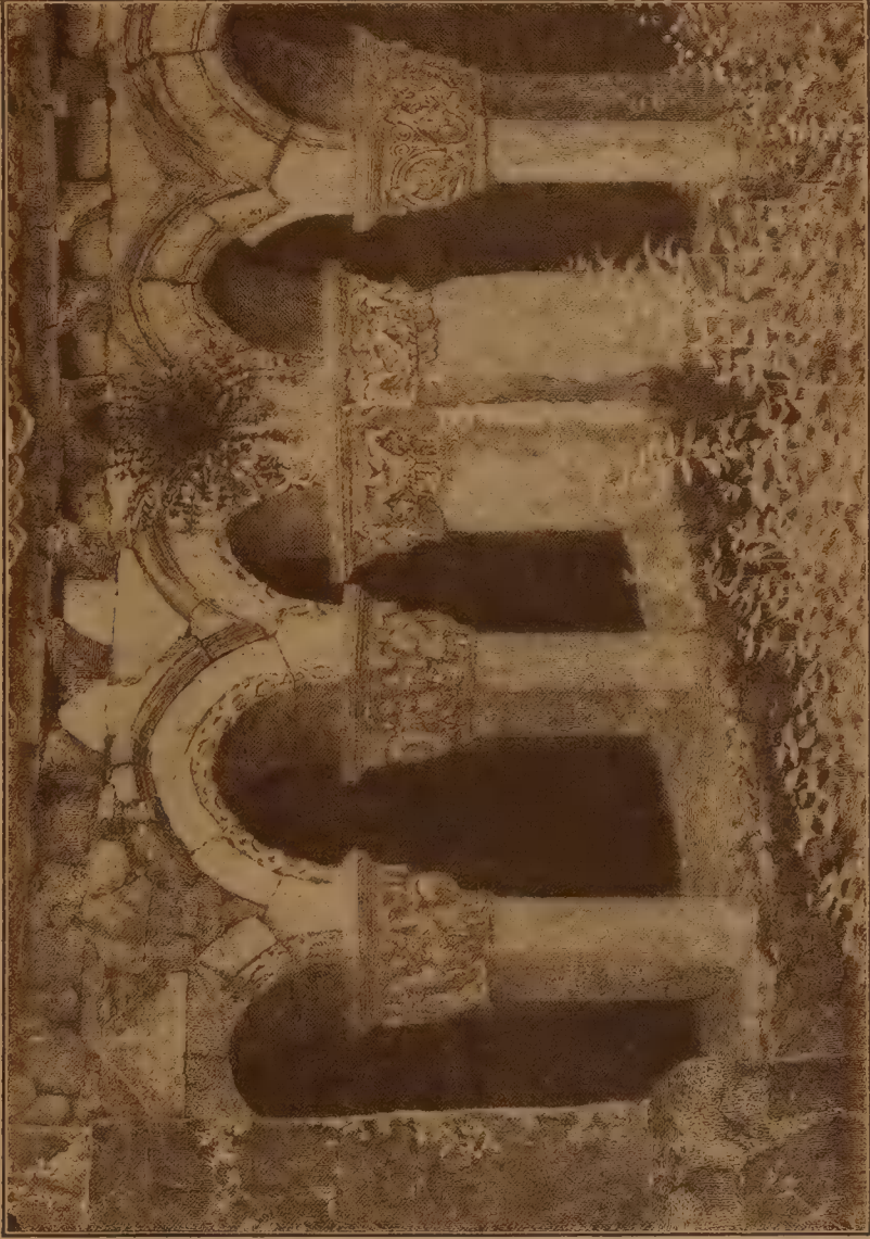
A RUINED CLOISTER